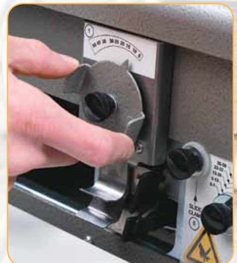
Simple dial adjustments to change from a 6 mm to a 50 mm coil.

Toll Free Order Line: 1.800.665.7884 Toll Free Fax: 1.888.665.7884 Phone: 204.663.9214 Fax: 204.663.7905 Email: info@plastikoil.com Web: www.plastikoil.com