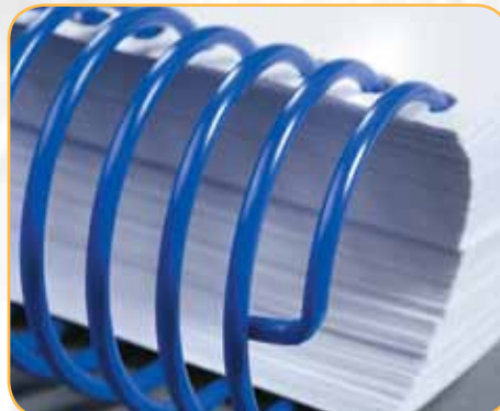
Longer crimp achieved as coil diameter increases.